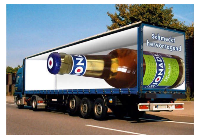
A way of advertising

Advertising is paid and/or sometimes free communication through a medium in which the sponsor is identified and the message is controlled. Variations include publicity, public relations, product placement, sponsorship, underwriting, and dales promotion. Every major medium is used to deliver these messages, including: television, radio, movies, magazines, newspapers, the Internet, and billboards. Advertisements can also be seen on the seats of grocery carts, on the walls of an airport walkway, on the sides of buses, heard in telephone hold messages and in-store PA systems. Advertisements are usually placed anywhere an audience can easily and/or frequently access visuals and/or audio, especially on clothing.