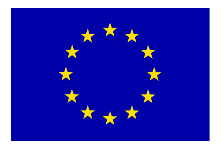
Symbol of European Union